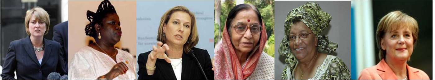
L-R Jacqui Smith, UK; Luisa Diogo, Mozambique; Tzipi Livni, Israel; Pratibha Patil, India; Ellen Johnson-Sirleaf, Liberia; Angela Merkel, Germany

Michelle Bachelet, Chile. Ellen Johnson-Sirleaf, Liberia. Angela Merkel, Germany. Luisa Diogo, Mozambique. Tarja Halonen, Finland. Helen Clark, New Zealand. Tzipi Livni, Israel. Pratibha Patil, India. These women may not be the first to lead their country, but they all have one thing in common: promoting women's issues and concerns from inside the world's legislatures.