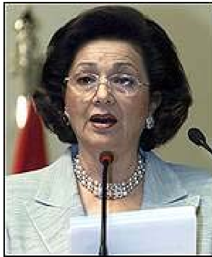
Egypt First Lady Suzanne Mubarak campaigned against the practice

Those who broke the law would be punished, and the doctor who carried out